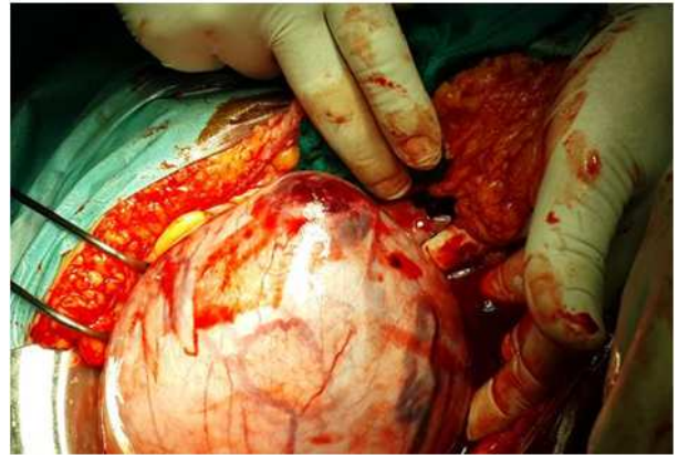
Figure 3. Intraoperative photographs showing the rudimentary uterine horn ruptured at the fundus