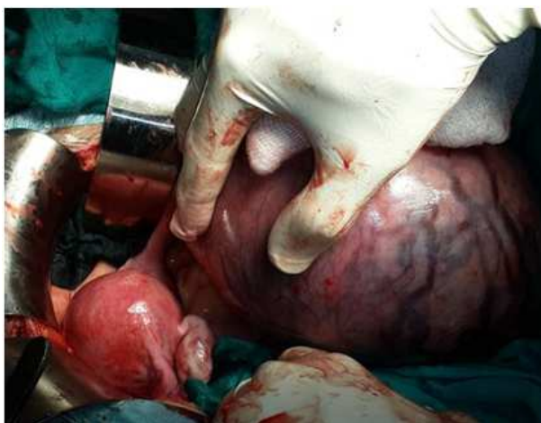
Figure 2. Intraoperative photographs showing the rudimentary uterine horn connected to the main uterus with a thick fibrous band