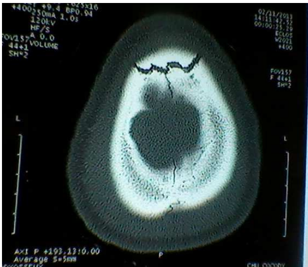
LouéFig 1.tif. CT cranio-encephalic highlighted a fracture of the cranial vault without mass effect or commitment.

Second resuscitative measures have been implemented since her admission and given the relatively stable hemodynamics, an additional assessment was made possible in extreme emergency. At a complete blood count, there was anemia 5.1 g / dl and thrombocytopenia (platelet = 106,000 cells / ml). Renal and liver function tests were normal, prothrombin rate was 53.9 %. Abdominal ultrasound confirmed uterine rupture and also highlighted a splenic rupture. The radiograph of the left ankle noted a bi-malleolar non-displaced fracture supra-ligament, CT cranio-encephalic highlighted a fracture of the cranial vault without mass effect or commitment (Figure 1).