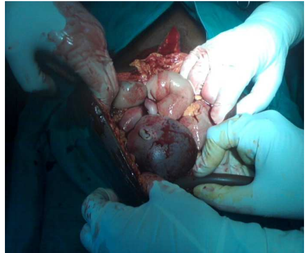
LouéFig 2.tif. Intraoperatively, after a midline incision, we found an abundant hemoperitoneum of about 3,5 liters in which bathed a death fetus aged about 28 weeks.

After rapid multidisciplinary consultation (obstetrics, anesthesiology, surgery, emergency and intensivists caregivers), an emergency laparotomy was performed under general anesthesia (induction of anesthesia was started by opioid (fentanyl) and low dose of sodium thiopental, the maintenance of anesthesia was continued by opioid drug), preceded by a fluid and electrolyte resuscitation including a blood transfusion (the patient received a total of 2,5 liters of red blood cells and 3 units of fresh frozen plasma intra and postoperatively).