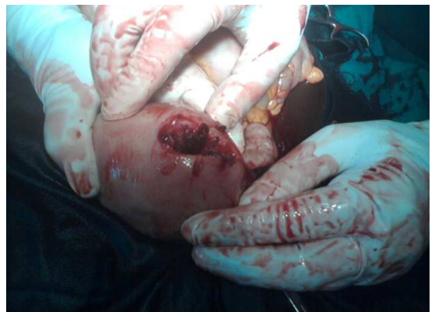
LouéFig 3.tif. Intraoperatively, the abdominal organs exploration revealed a complete uterine rupture sit at the fundus of about 8 cm.

Intraoperatively, after a midline incision, we found an abundant hemoperitoneum of about 3,5 liters in which bathed a death fetus aged about 28 weeks ( Figure 2). Abdominal organs exploration were done that revealed a placenta expelled in part, a complete uterine rupture sit at the fundus of about 8 cm (Figure 3), and a splenic rupture with splenic vascular pedicle injury (Figure 4). Other intra- abdominal organs were intact. We performed a conservative uterine suture and total splenectomy. The left ankle was immobilized in a plaster boot. After the operation, the patient was admitted in intensive care unit. Anti-pneumococcal and Haemophilus vaccination was made for the prevention of infections at the fifteenth day of hospitalization. Postoperative course was uneventful and the patient was discharged on the 19th day of hospitalization and was addressed to neurosurgeon's consultation.