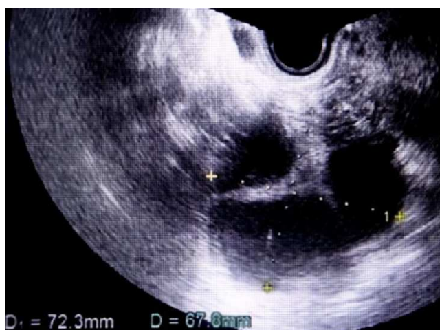
Figure 2. Transvaginal ultrasound images showing markedly enlarged polycystic ovaries. The right ovary measured 72.3 × 67.8 mm.