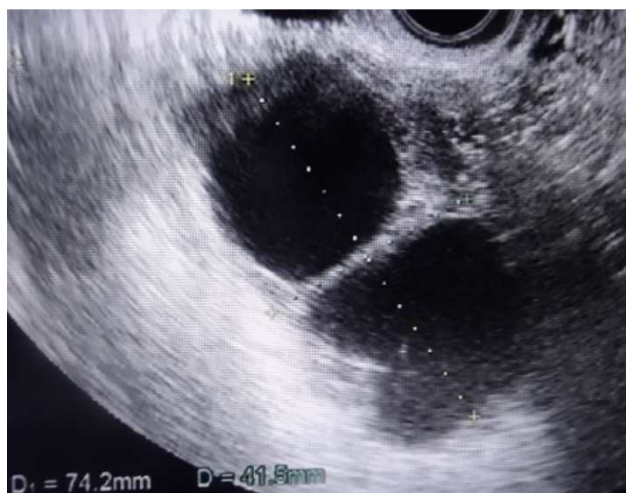
Figure 3. Transvaginal ultrasound images showing reduction in the size of the polycystic ovaries. The right ovary measured 74.2mm × 41.5mm.

The patient required no medication for OHSS. Three days later, her abdominal symptoms had improved, but the sizes of the ovarian cysts were unchanged. Laboratory studies did not show hemoconcentration (hematocrit, 40%, hemoglobin, 129 g/L), leukocytosis (WBC, 7.8 \times 10^9 /L), or hypoalbuminemia (serum albumin, 39 g/L). Four days later, her abdominal symptoms had disappeared, and the ovarian cysts were reduced in size (Figure 3). The serum hCG level was less than 1 IU/L. After four more days, the ovarian cysts had disappeared.