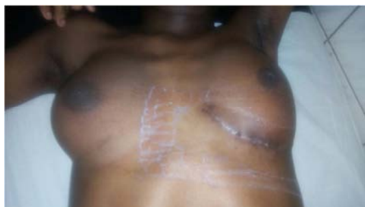
Figure 8. View 14 days postoperative.