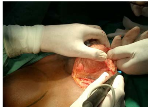
Figure 6. Remodeling.