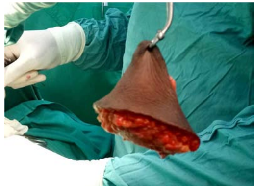
Figure 5. Ablated supernumerary breast.