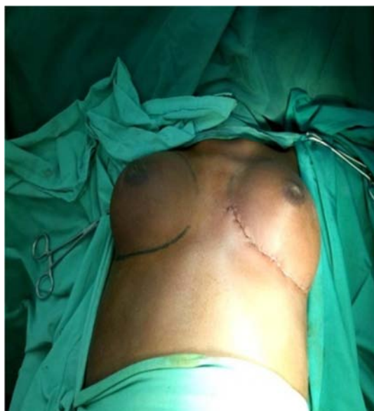
Figure 7. Immediate post-operative view.