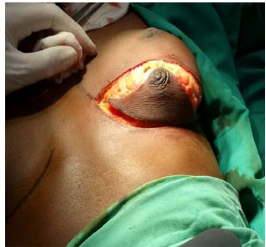
Figure 4. Cutaneous incision.