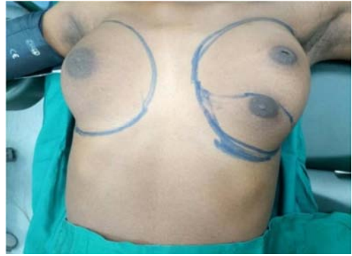
Figure 3. Preoperative view.