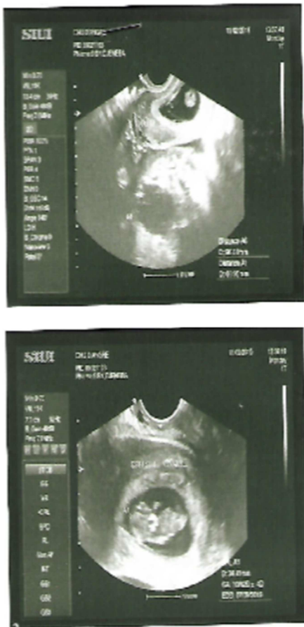
Figure 1. Obstetric ultrasound Progressive pregnancy of 10 weeks associated with a right ovary cyst of 96 mm x 60 mm.

Mature ovarian teratomas are thought to be of parthenogenetic origin [8]. In fact, a pluripotent stem cell or a primordial germinal cell before meiosis I of oocytes would be the starting point of mature ovarian teratomas [9]. Thus, mature teratomas result from the proliferation of immature cells from the three embryonic layers: endoderm, mesoderm and ectoderm [10].