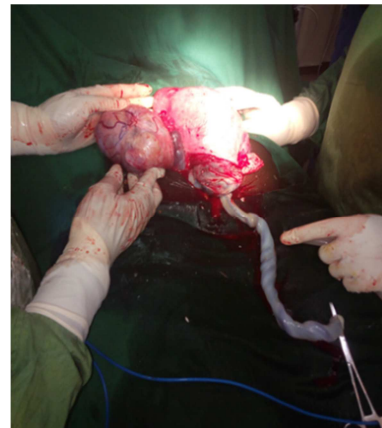
Figure 2. Right ovarian cyst after fetal extraction.

Benign ovarian tumor pathology during pregnancy is dominated by dermoid cysts or mature teratoma. According to