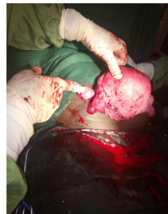
Figure 3. Right ovary after cystectomy.