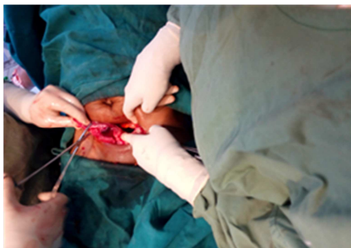
Figure 3. Treatment of our case, with removal of last part of the uterus.