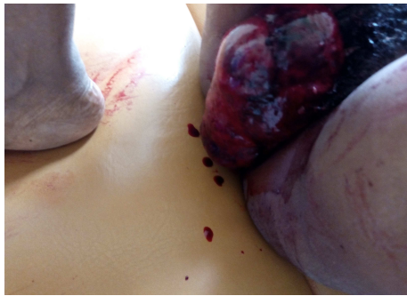
Figure 1. Uterine inversion stage 4.