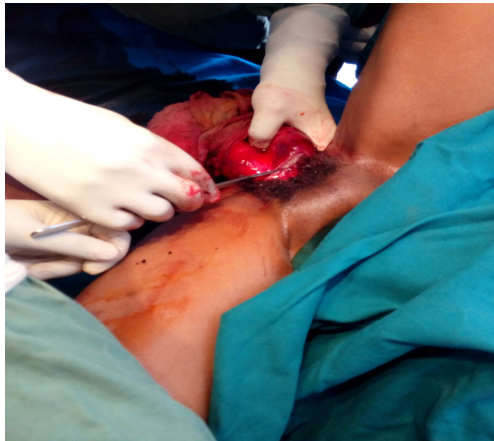
Figure 2. Treatment of our case by hysterectomy, on of the outer part of the uterus with clampage of uterine vessels.